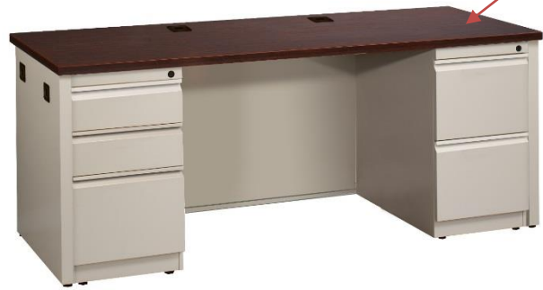
DESKS, RETURNS, BRIDGES AND CREDENZAS HERE